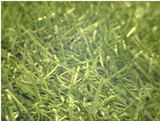
General surface view.