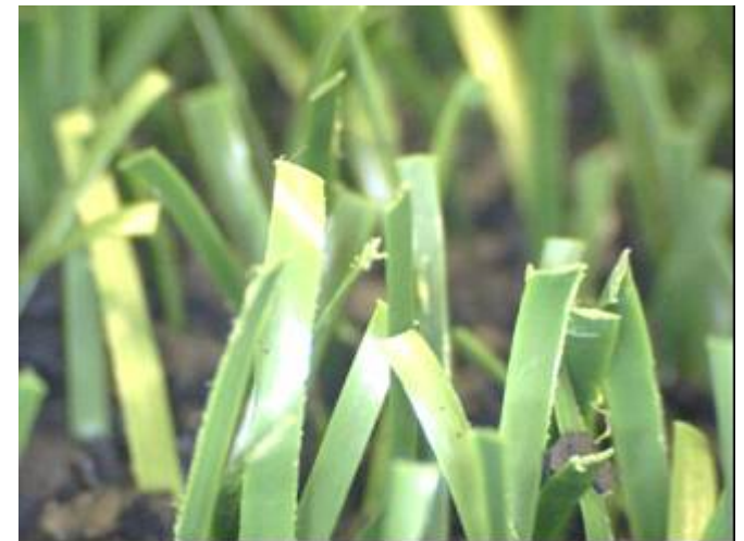
Yarn Close up.