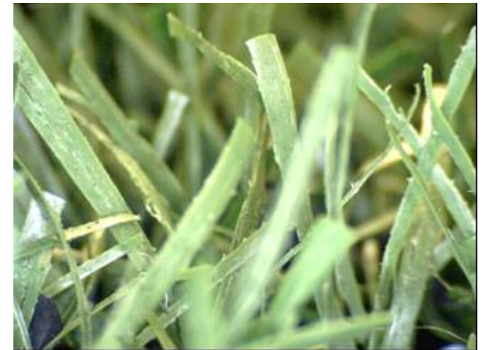
Yarn Close up.