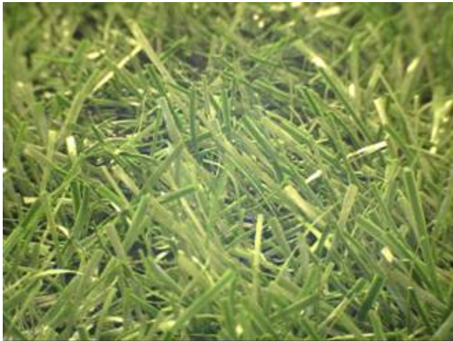
General surface view.