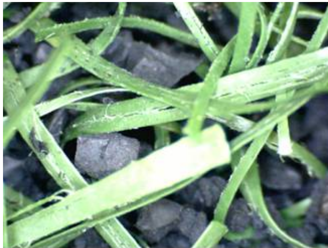
Close up of infill and Yarn Fibre.