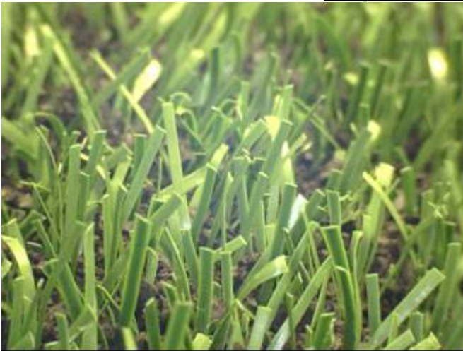
General surface view.