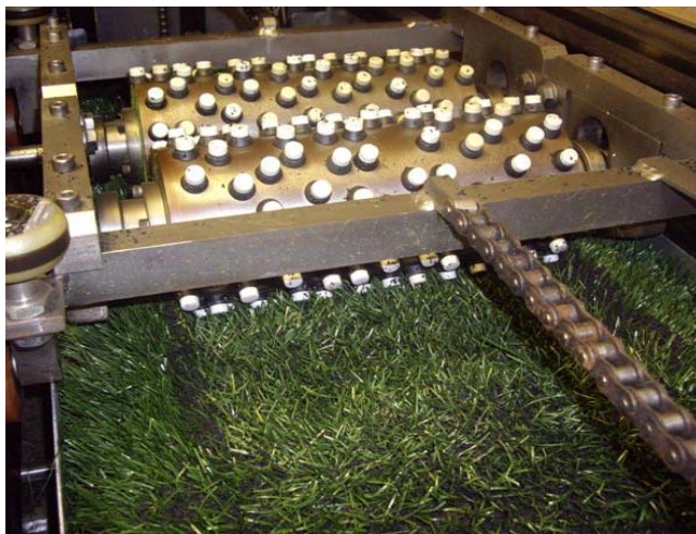
Plate showing Lisport in action on actual sample