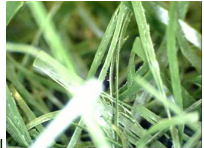
Yarn Close up.