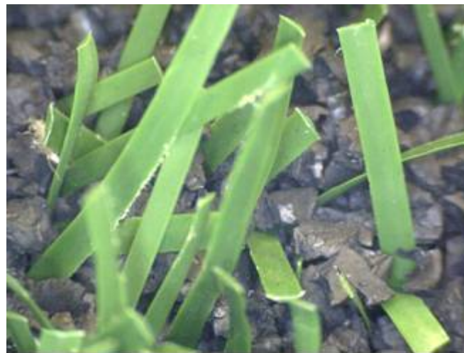
Close up of infill and Yarn Fibre.