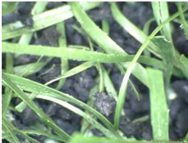
Close up of infill and Yarn Fibre.